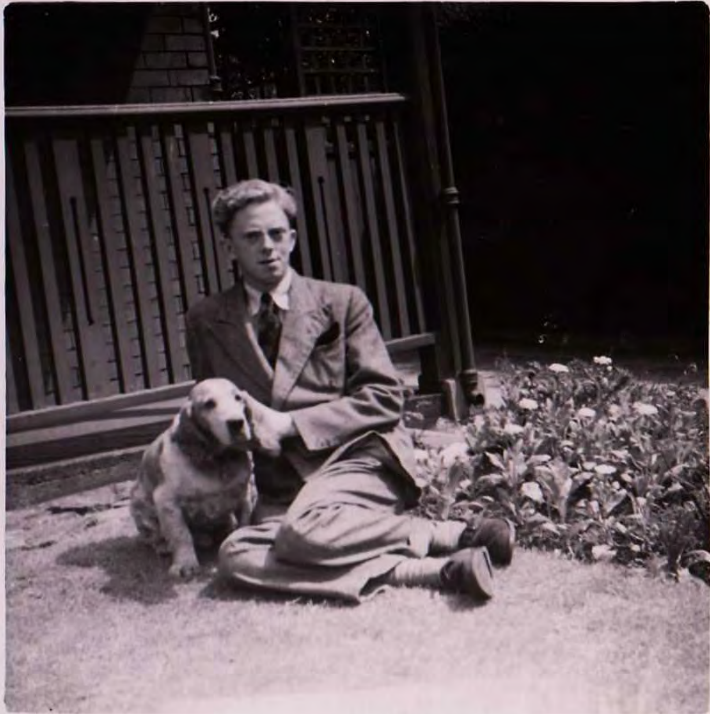
With Rex in 1949