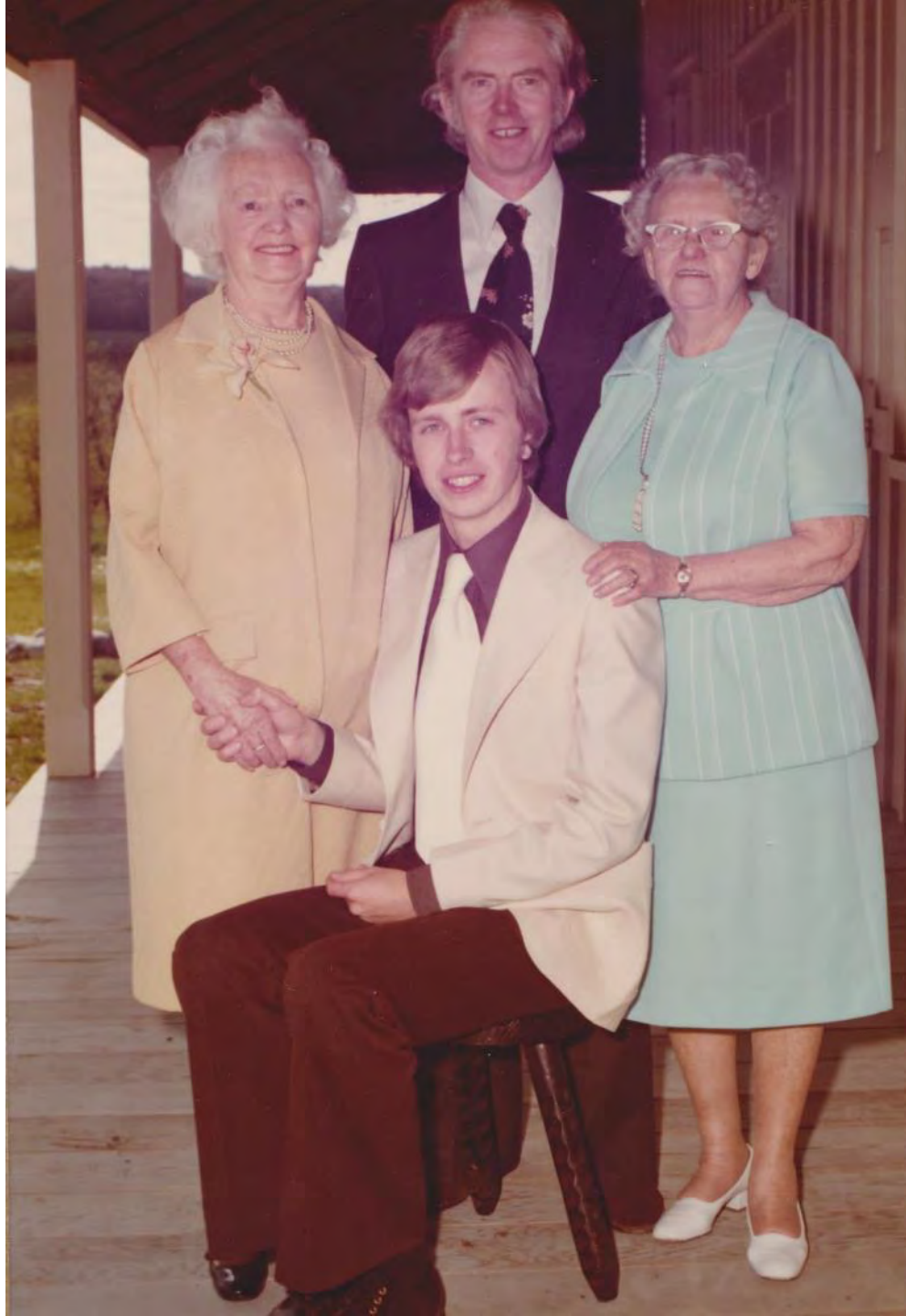
Four generations In 1976