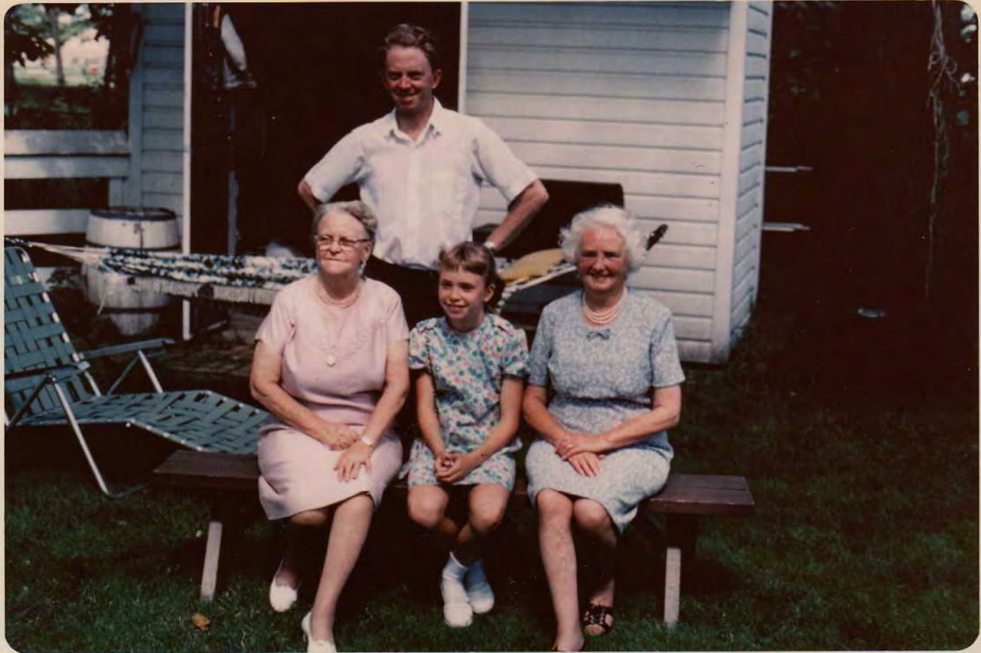
Four generations in 1968