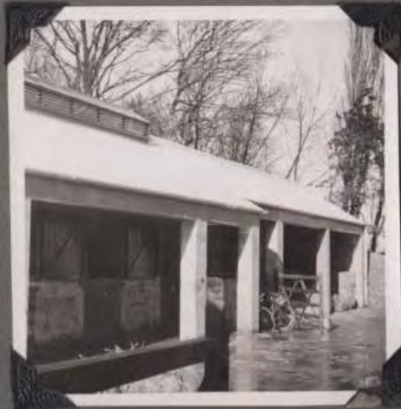
THE YARD AND STABLES.