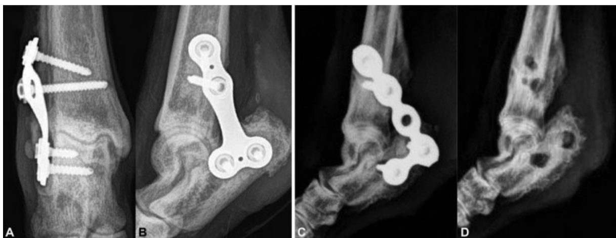
Fig. 5 Complications: Radiographic follow-up at 4 weeks (A, B) showing screw pull-out in case 7 (bacterial culture had not yielded bacterial growth). Severe case of bacterial osteomyelitis before (C) and after implant removal (D) at 6 weeks (bacterial culture confirmed Staphylococcus aureus infection) in case 1.